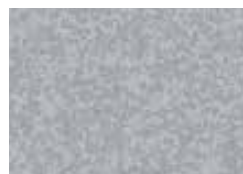
Cool ZINCALUME® Plus