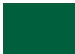
Cool Denali Green