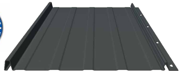
Skyline Roofing® in Slate Gray