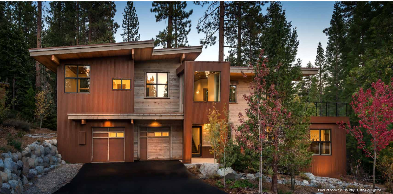
Product shown in Country Rustic Corrugated