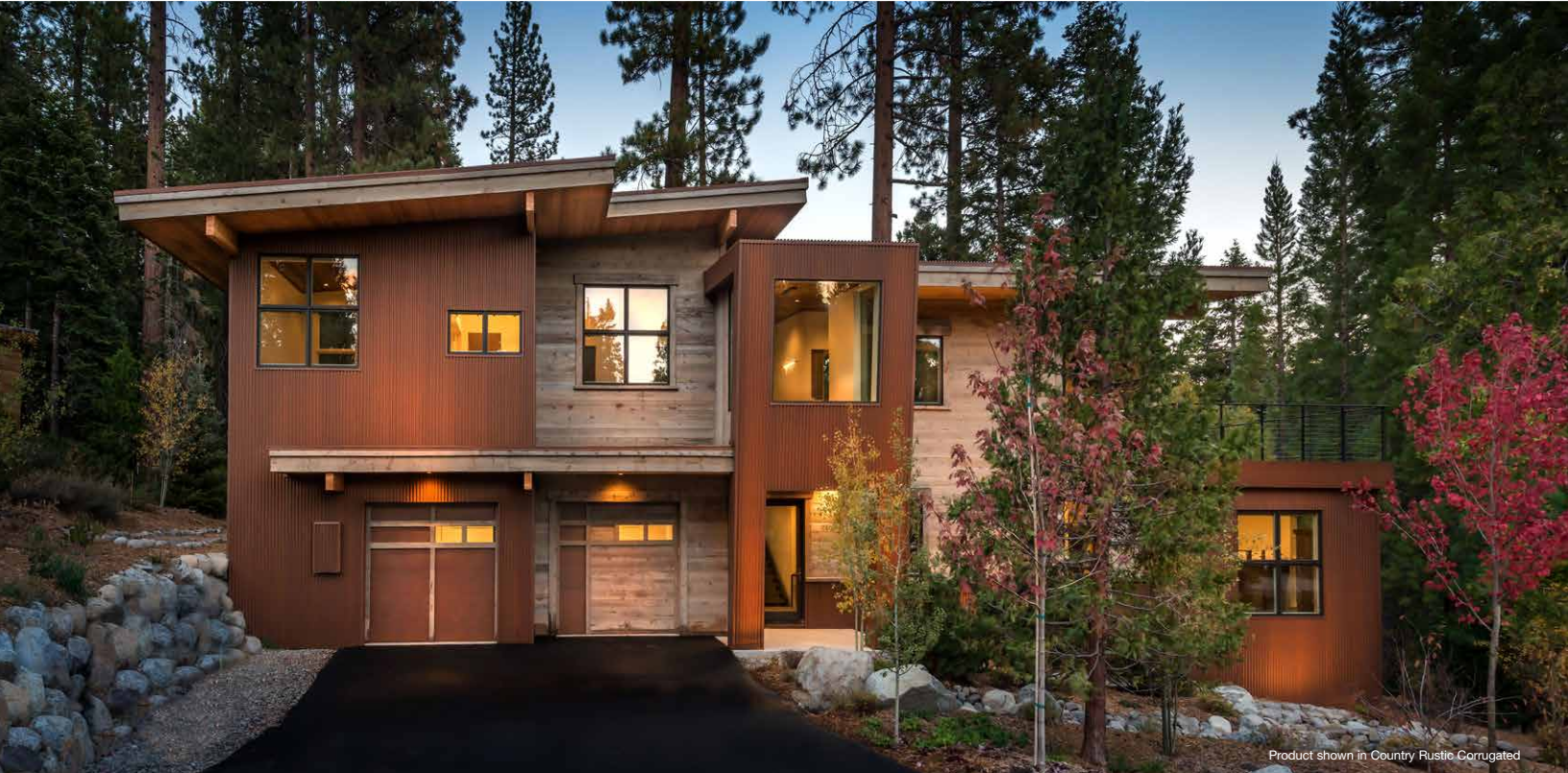
Product shown in Country Rustic Corrugated