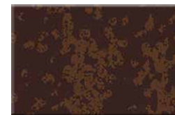
Now available in Natural Rust† 26 Gauge

† Please note these colors are batch sensitive (may have color variation) and are directional in nature. Different batches are not to be mixed on projects. We recommend that you request a sample of current stocked material to review actual color before ordering to ensure color accuracy. We are not responsible for color variations.